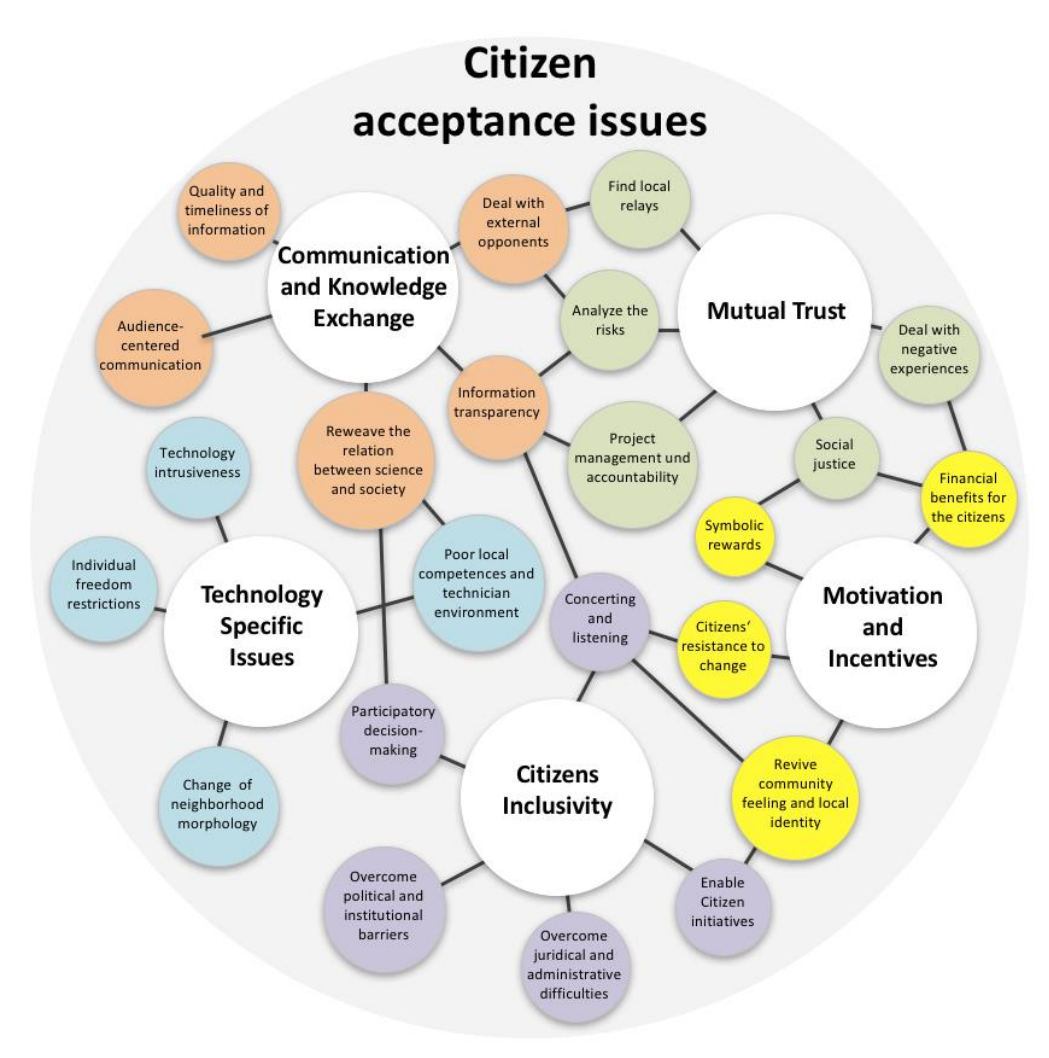
Figure 2: Dependencies between the different societal issues

Some of the listed acceptance issues are interlinked and interdependent. Consequently, the analysis of the issues as well as the listed best practices may overlap some points. Figure 2 shows the main dependencies between the individual issues. For the sake of clarity, these interrelations are not further addressed in the following sections.